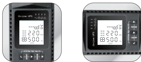
Two directions LCD display