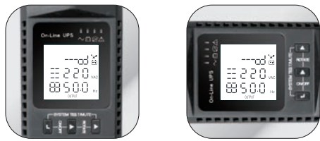
Two directions LCD display